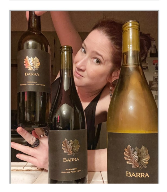
"Damn this is good."