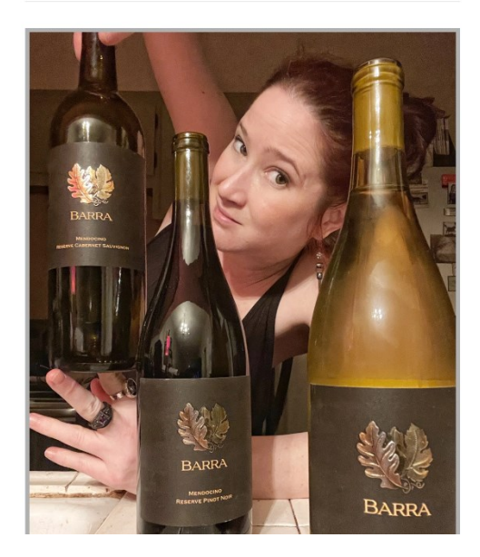
"Damn this is good."