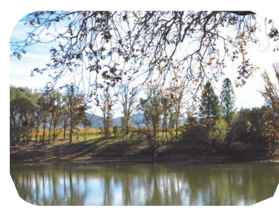
Beautiful pond for canoeing

This new acreage, located on the northwest property line of the home ranch, is an amazing piece of land that we have had our eye on for several years. With 13 acres of certified organic Chardonnay and 15 acres of Cab, a 49 acre-foot lake, 16 different fruit trees and an organic garden, this opportunity