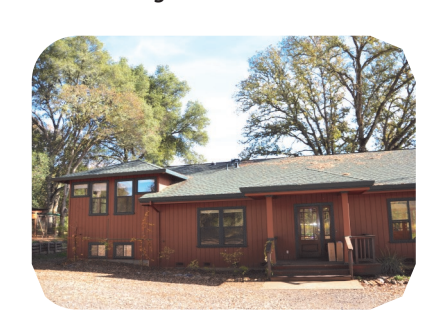
4 bedroom home located on property

was one that we could not pass up. With its natural water storage, excellent soils and certified organic status, we know that the fruit that this vineyard produces will be a wonderful addition to the BARRA of Mendocino wine program.