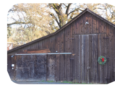
Charming old barn at entrance